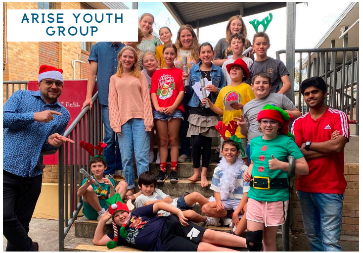
ARISE YOUTH GROUP