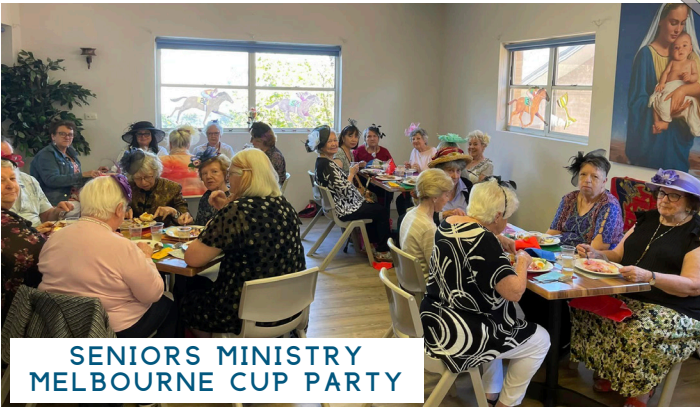
SENIORS MINISTRY MELBOURNE CUP PARTY