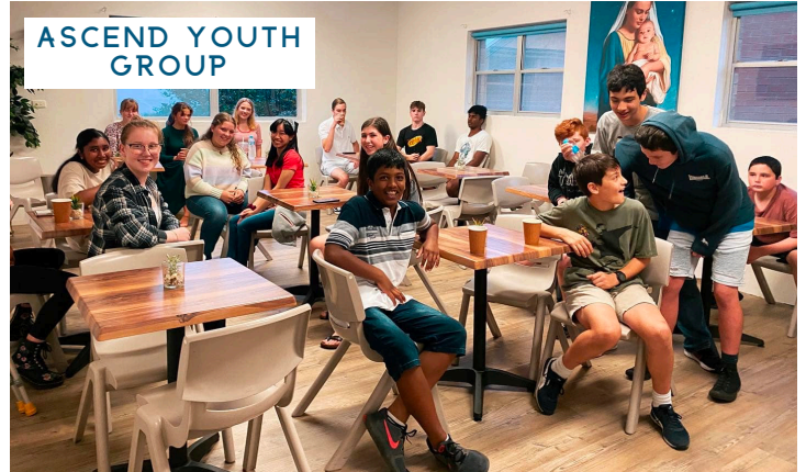
ASCEND YOUTH GROUP